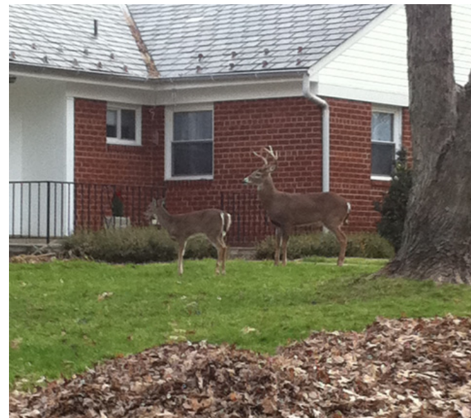
A couple of deer visit Pastor Dave at the parsonage.

This months long project has culminated with new computers in all the offices, a new server (and all the accessories needed with that), updated wiring, new software, wireless availability in the office wing and Sanctuary, along with a switch to Verizon FIOS. We now have a local and remote cloud based back up solution. We are ready to go!